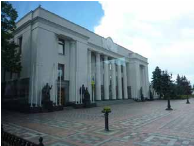
KGB Headquarters – Kiev