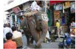
Village visits create such excitement