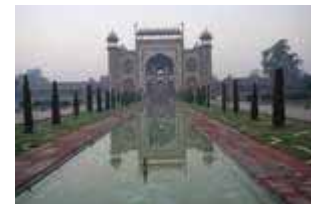
The Taj Mahal