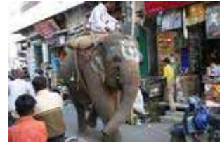
Village visits create such excitement