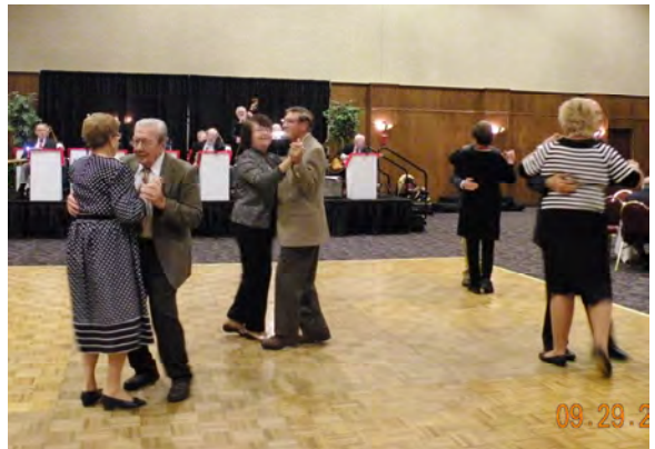
Dancing and entertainment with music provided by the Wilson Knights Big Band