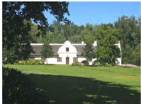
Typical Stellenbosch wine estate.