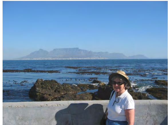
Cape Town and Table Mountain from Robin Island where Nelson Mandela was imprisoned