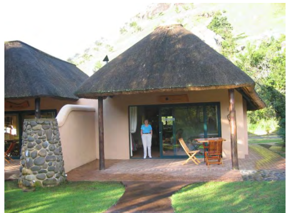
Typical game reserve accommodation