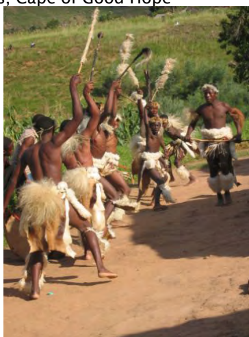
Zulu war dance