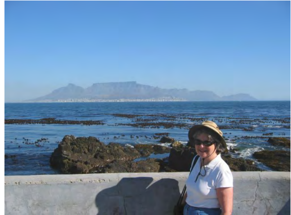
Cape Town and Table Mountain from Robin Island where Nelson Mandela was imprisoned