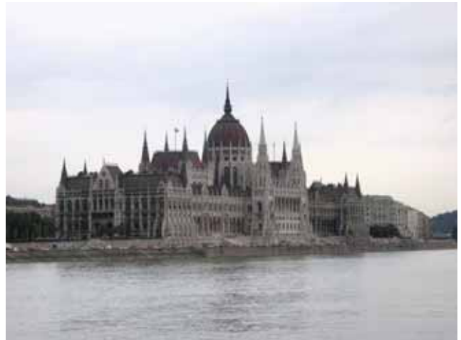
Hungarian Parliament Building

Pat and I enjoyed a 10 day Danube river cruise from Vienna to the Black Sea and back as far as Budapest. We then spent a couple of days in Warsaw before returning home. It was a great way to visit multiple countries without the hassle of having to frequently pack and unpack. The changes since our last visits to countries such as Serbia, Romania and Bulgaria were dramatic. Warsaw which had been 80% destroyed in WWII proved an agreeable mixture of rebuilt to look old and Soviet era concrete boxes.