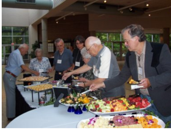
Attendees enjoy a sumptuous appetizer buffet