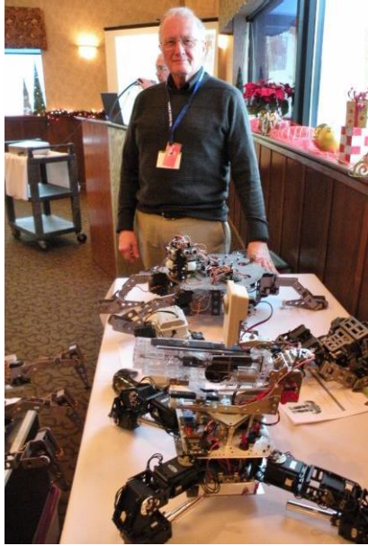
Dennis Miller & Walking Robots