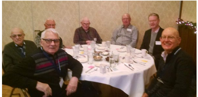
Your fellow retirees enjoying the luncheon!