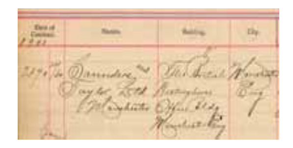
1901 entry from the Johnson Electric Service Company's Milwaukee contract book for the British Westinghouse Electric Company installation in Manchester, England