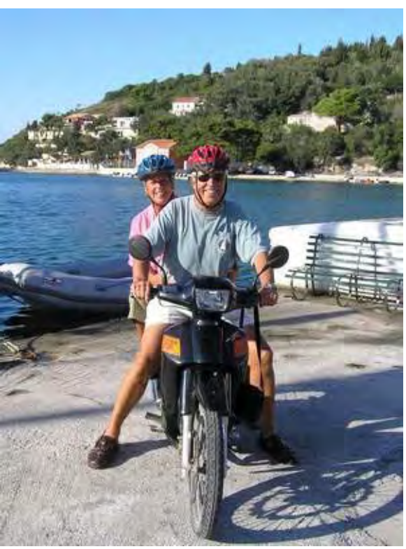
Motor scooter on Paxi Island