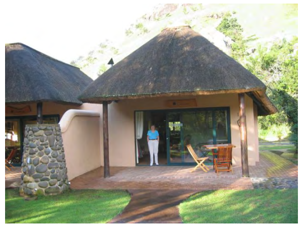
Typical game reserve accommodation