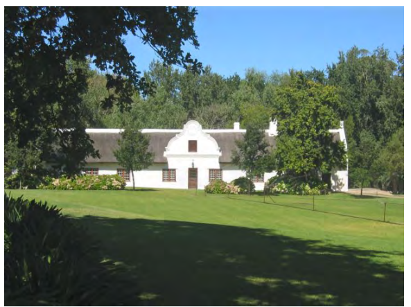
Typical Stellenbosch wine estate.