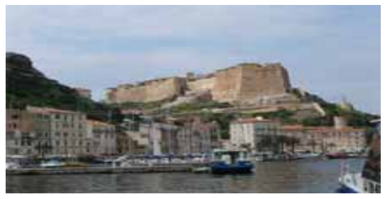
The fortified city of Bonifacio at the southern tip of Corsica is the jumping off point for Sardinia. The citadel is perched high above on magnificent sheer cliffs.