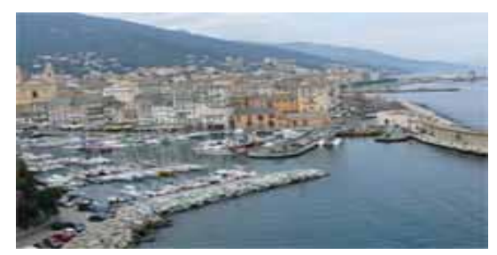
Bastia the capitol of northern Corsica. The island's major port and business center. Main harbor for ferries to Italy and France.

In two and a half weeks we never saw a chicken let alone eat one. The scenery was often spectacular and provided interesting surprises such as a huge number of cork, olive and chestnut tress. Thousands of the latter have been abandoned due to the hard manual work involved in processing the nuts. Weather in April and May is very mild and was virtually rain free during our visit.