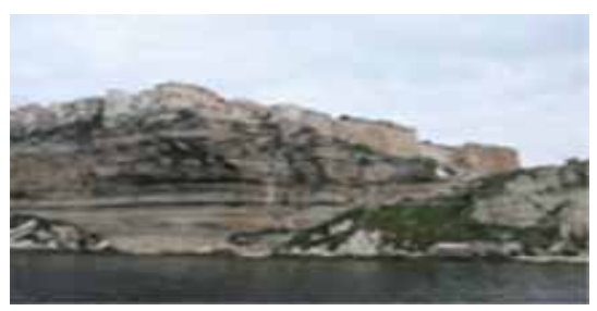
A view of the upper city and citadel from the ferry on its way to Sardinia .