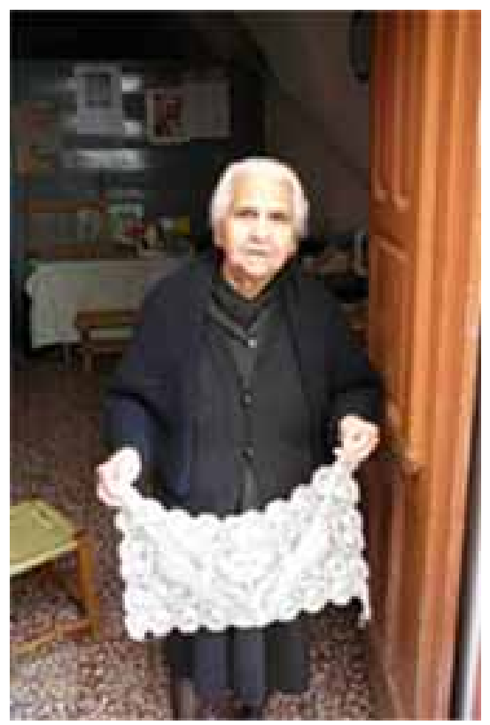
89 year old Sardinian lace maker