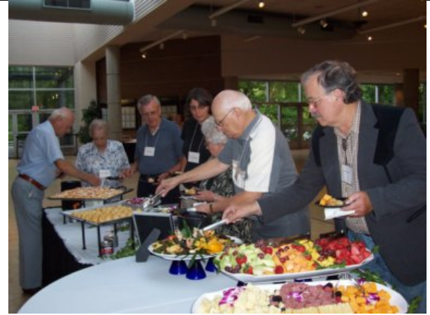
Attendees enjoy a sumptuous appetizer buffet

Friday evening, September 19<sup>th</sup> – Milwaukee County Zoo