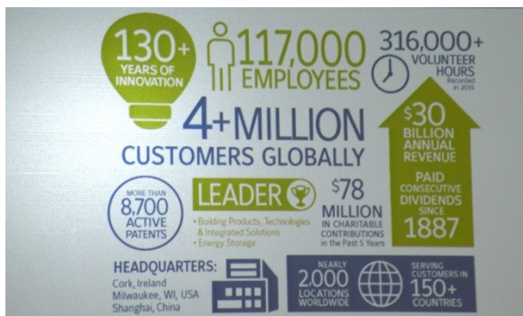
The company today