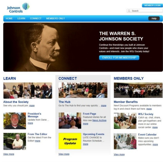
The WSJ Society website