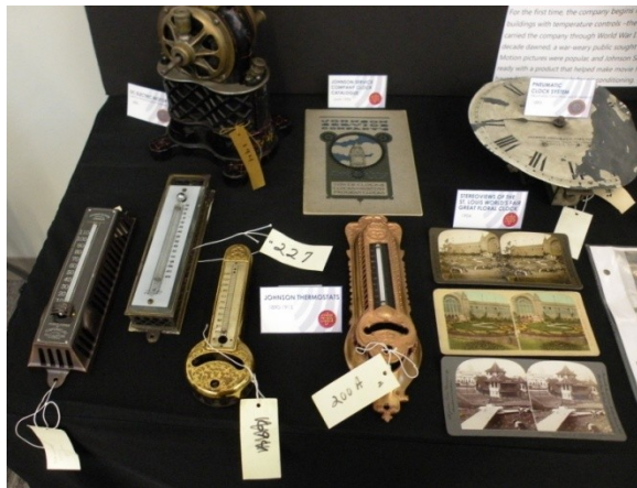
some of the company's history