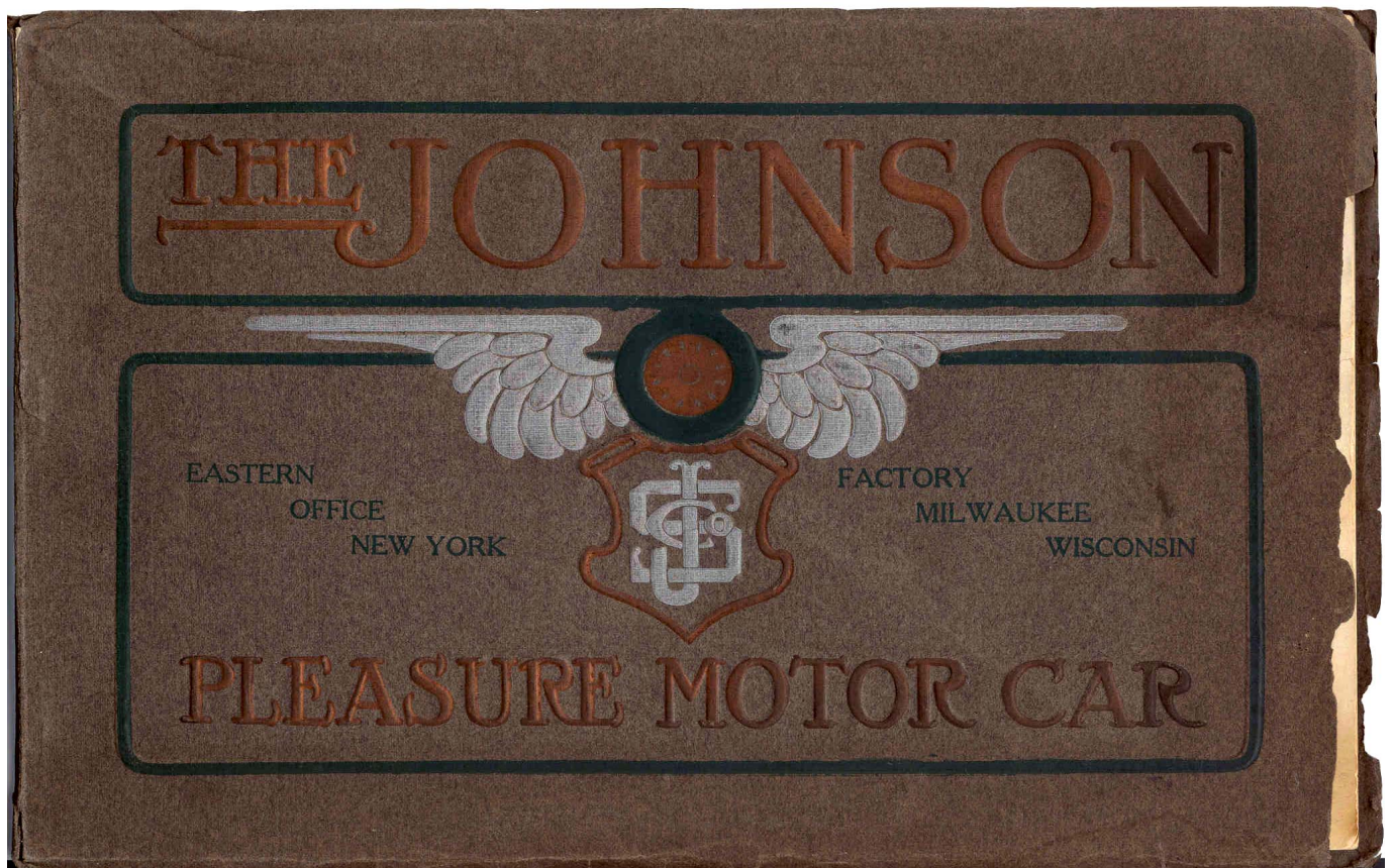
Cover from a Johnson Service Company "Pleasure Motor Car" brochure, circa 1910