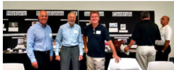
Members at the JCI Timeline ... Reunion 2016