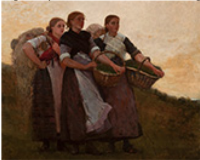
Image: Hark! The Lark, 1882 Oil on canvas Winslow Homer (American, 1836–1910)

Speaker: Laura Lange, Milwaukee Art Museum Docent Coming Away: Winslow Homer and England