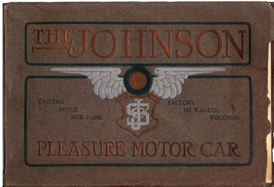
Cover from a Johnson Service Company "Pleasure Motor Car" brochure, circa 1910